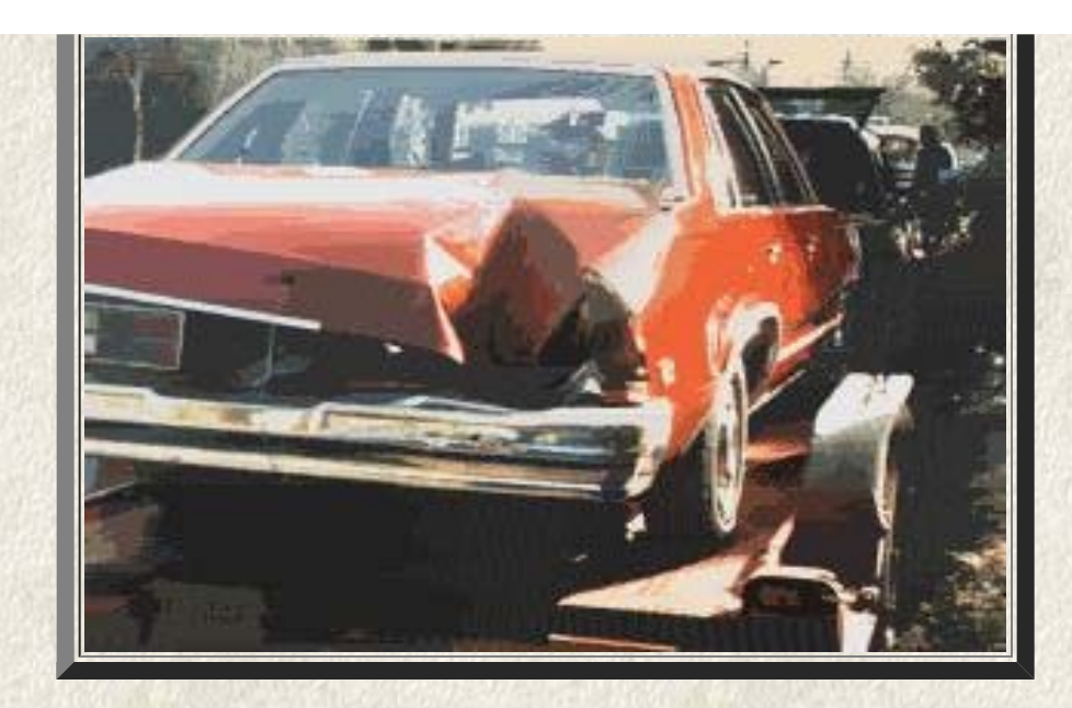
The Malibu after the meteorite hit!