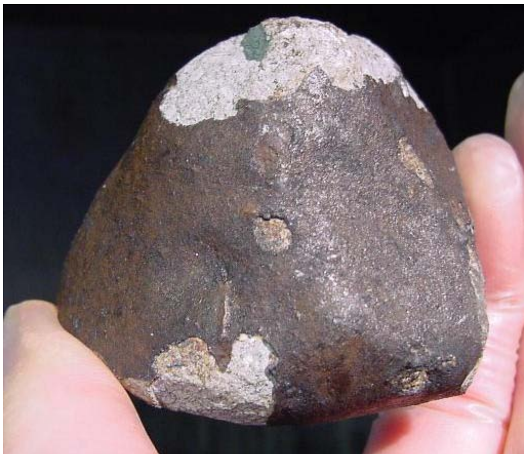
Fresh, fusion crusted 294.5g individual.