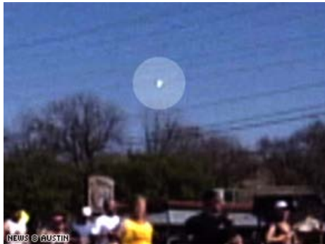
Video captured in Austin, Texas, shows a meteor-like object in the sky Sunday morning.

(CNN) -- Just like some U.S. officials looking into the mystery, the man who captured video of an apparent fireball plunging from the sky over Texas on Sunday is perplexed about what it was.